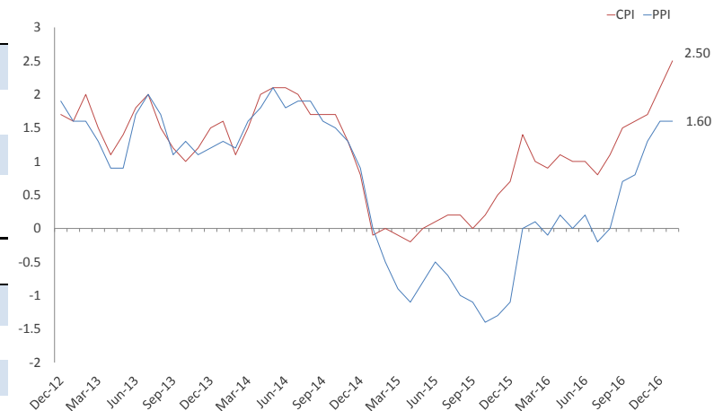
Chart of the Week: CPI & PPI Final Demand YoY As of January 31, 2017