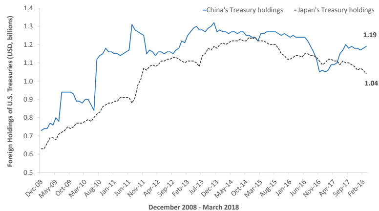
Chart of the Week: China's U.S. Debt Holdings Rise while Japan's Fall As of March 31, 2018